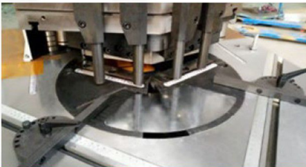
Cutting Positioning Scale