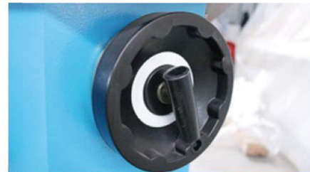
Blade Ajusting Crank