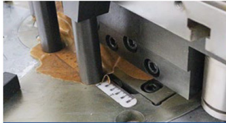
Upper And Bottom Blades