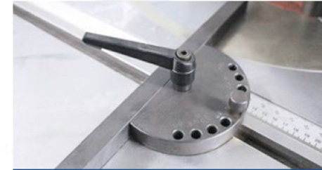
Sheet Metal Positioning System